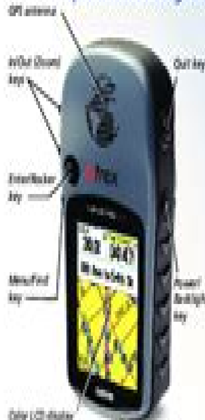
or the Legend shown