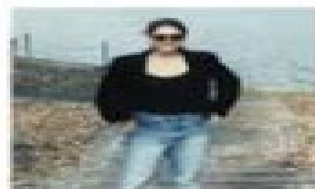
Before, at size 16

HOW I LOST 40 LBS AND KEPT IT OFF— AND HOW YOU CAN TOO!