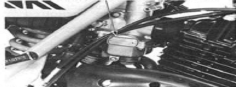
CARBURETOR IDENTIFICATION NUMBER

The carburetor identification number is on the right side of the carburetor body.