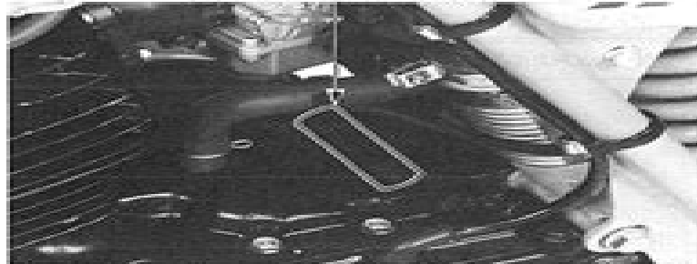
ENGINE SERIAL NUMBER

The engine serial number is stamped on top of the crankcase.