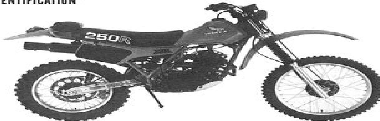
DATE OF MANUFACTURE