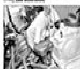
1.26 Remove the 100 mm (4 inches) centre support from the timing cover

12. Unscrew the 100 mm (4 inches) centre support from the timing cover and remove the timing cover (see Illustrations 1.25).