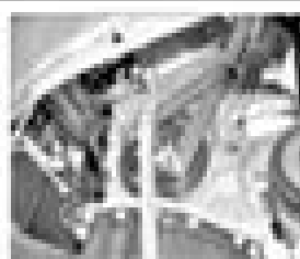
1.11 Remove the alternator (see Notes)