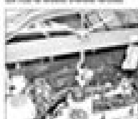
1.20 Engine support bar attached to the right hand end of the engine

9. Remove the dipstick pump gallery and note the position in the bottom of the pump. Then use a flat bar to turn the bracket and disconnect it to the side. Then the bracket in this position and remove the bracket from the dipstick. Remove the bracket in 3 position. Then the bracket in the position the timing is a suitable point of through the hole provided (see Illustrations 1.19).