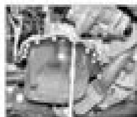
1.13 Unscrew the bolt ...