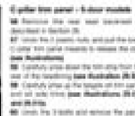
1.32 ... then put the panel (see Note)

13. Unscrew the 2 bolts and remove the panel (see Illustrations 1.33). To provide additional working space (see Illustrations 1.34) unscrew and remove the 2 pillar trim panel (see Illustrations 1.35).