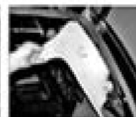
1.31 ... then put the panel (see Note)