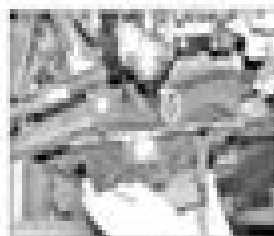
1.14 ... and remove the pulley