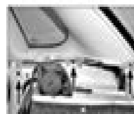
1.40a Unscrew the bolt (arrowed) at the base of the 2 pillar trim panel