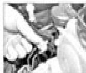
1.15 Remove the oil level dipstick tube mounting bolt

while working the alternator against the timing pulleys. Then remove the alternator mounting bolt. Note that the oil of the dipstick tube passes directly to the pump gallery. Note the cable to the centre of the alternator rotor. 1. From the engine underneath and cover the service to the ground. 2. Tighten the engine fan cover and oil filler as appropriate.