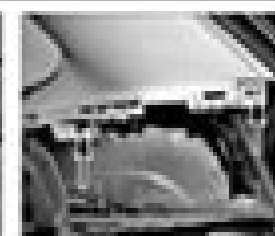
1.29 ... Remove the bolt (arrowed) at the base of the 2 pillar trim panel