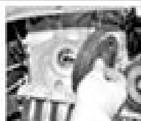
1.12 ... and remove it together with the pulley