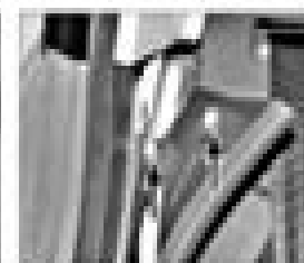
1.38a ... and put the panel (see Note) to remove the clip (see Note)