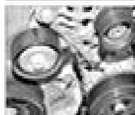
1.10 Unscrew a suitable pinned bolt (arrowed) to secure the auxiliary mounted alternator