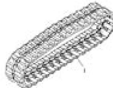
Fig. 16 Rubber crawler assy