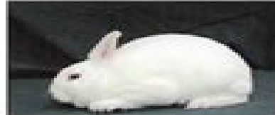
Blue Eyed White