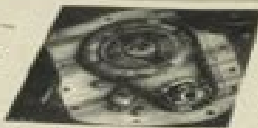
Fig. 4.11 Détail de l'arbre à cames et de la soupape d'admission.

LIVRES TECHNIQUES DE L'AUTOMOBILE DE COLLECTION