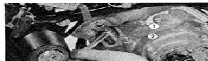
Fig. 1-12 ①, ② Tappet wrench (07908-3290000)

After installing a new valve guide, be sure to finish its inside surface with reamer (Tool No. 07984-2000000).