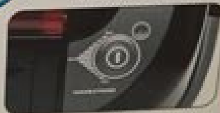
Adjustable Suction Power