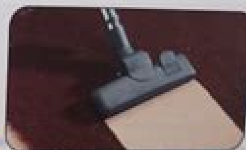
Power Vacuum - Wet & Dry