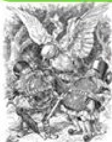
MAGNET FOR MURDER.