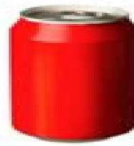
soda/ soft drink / pop