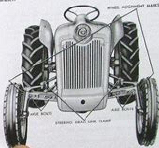
Figure 24 Front Wheel Toe-In Adjustment

When the wheels are in the straight-ahead position, all backlash should be removed. If the wheels are turned to the extreme right or left, slight backlash will be present, due to the gear tooth design. This characteristic permits a backlash adjustment for wear between the worm and teeth and the sector gears in the mesh used center position without causing binding or tightness in the sector gears and worm nut. Any adjustments necessary should be performed by your tractor dealer.