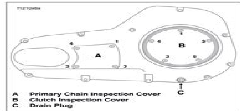
Figure 1-5. Primary Chaincase Cover