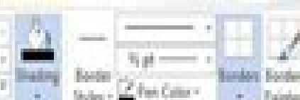
Table Style Options