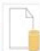
Blank desktop d...