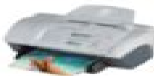
hp officejet 5110 printer/fax/scanner/copier

** Up to 4800 x 1200 optimised dpi colour printing on premium photo papers and 1200 x 1200 input dpi.