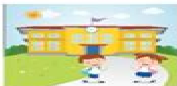
go to school