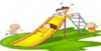
play in the park