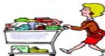
do the shopping