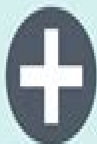
Phillips screw (PH)