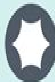
Torx screw (T)