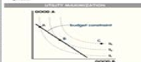
FIGURE 2 Point A is within the budget constraint but is on a lower indifference curve than point B, which is the utility maximization point. Point C is on a more desirable indifference curve but is not a possible choice because it is outside the budget constraint.