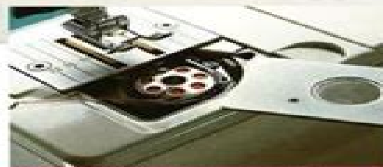
DROP-IN BOBBIN No bobbin case. The bobbin is