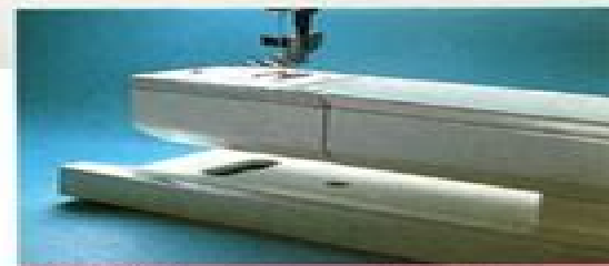
FREE ARM Converts to two sizes. I use the standard