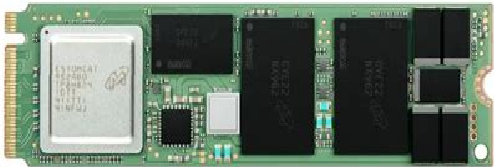
Figure 1: Client and data center SSDs may look similar 2