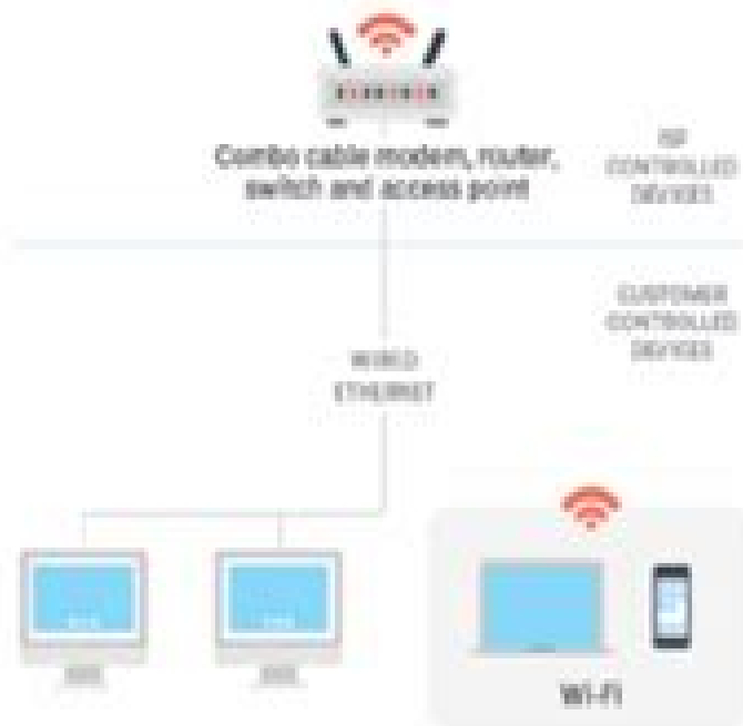
Simple Home Network