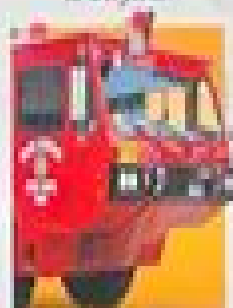
crash rescue rig