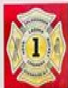
fire engine badge