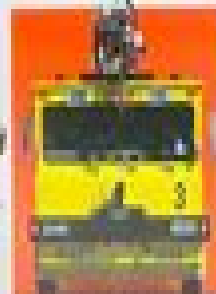
airport fire truck