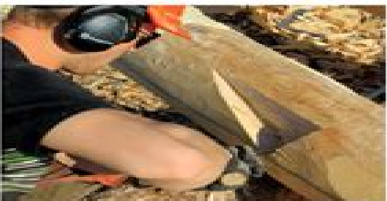
Figure 26: Cleaning out half of a joint. Note the lines on the top that are for tenon layout.

for example). The tenons, and the mortises to match them, are laid out from the chalklines / centerlines that you snapped on every log in the truss.