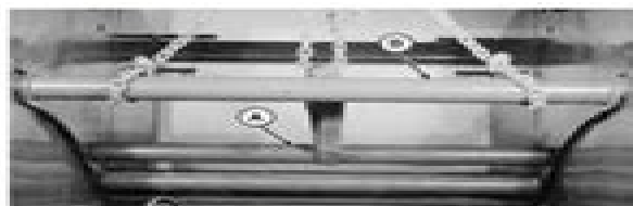
Attach Hoist to Tension Arm Center Roll

Do not use chains to attach hoist to center roll (A). Chains may damage the roll. Use a lifting strap instead.