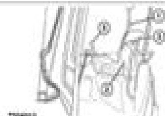
1. Boom Rest