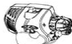
MightyLite 26SS UT21546, UT21947