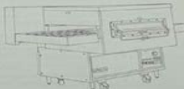
PS360 (Double Model)