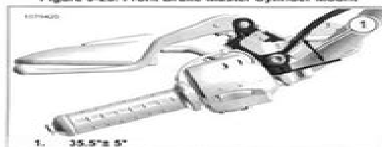
Figure 3-29. Front Master Cylinder Brake Line Location