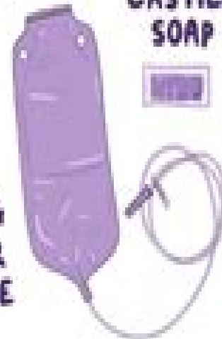
ENEMA BAG w/ TUBING & RECTAL TUBE