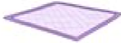
WATERPROOF BED PROTECTOR