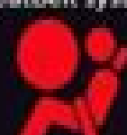
Airbag and seatbelt system