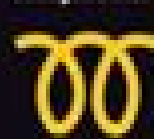
Engine management lamp