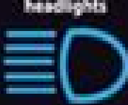
Main beam headlights