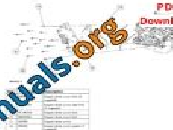
Fig. 28. Identifying Upper Front Cover Components (2 of 2)