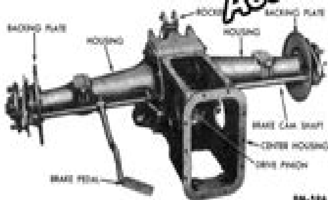
Fig. 32—Rear Axle Assembly

Lift the axle shafts from the axle housing. Remove the cap screws that secure the left-hand axle housing to the center housing, and remove the axle housing. Lift the differential from the center housing (fig. 35). Remove the right-hand axle housing from the center housing.