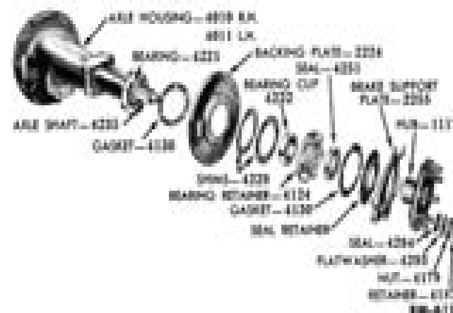
Fig. 34—Backing Plate and Hub, Disassembled

Place the axle shaft assembly on a bench, and remove the lock ring that secures the axle shaft nut. Remove the axle shaft nut, flat washer, and seal. Remove the cap screws that secure the differential gear case to the axle shaft housing. Separate the two halves. If necessary, use a hammer to tap the two halves apart. Remove the differential spider, together with the differential pinions and thrust washers, from the differential gear case (fig. 35). Remove the differential side gears and thrust washers.