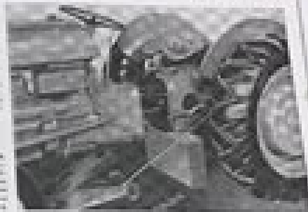
Fig. 10-14-100 (right) shows front view of Model 100.

The Model 100 (10-14-100) is a major advance in design and construction. It is a complete unit, built in one piece, and is designed for long life and low maintenance. The new transmission is built in one piece, and is designed for long life and low maintenance.