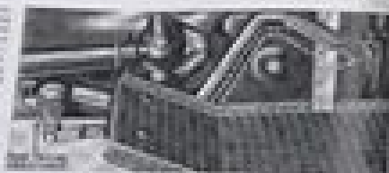
Fig. 10-14-100 (left) shows front view of Model 100.

The Model 100 is a major advance in design and construction. It is a complete unit, built in one piece, and is designed for long life and low maintenance. The new transmission is built in one piece, and is designed for long life and low maintenance.