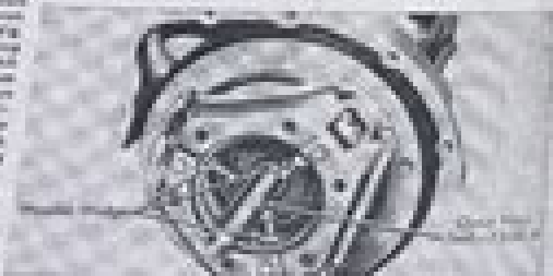
Fig. 10-14-100 (right) shows front view of Model 100.