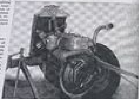
Fig. 10-14-100 (right) shows front view of Model 100.