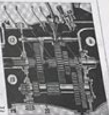
Fig. 10-14-100 (right) shows front view of Model 100.