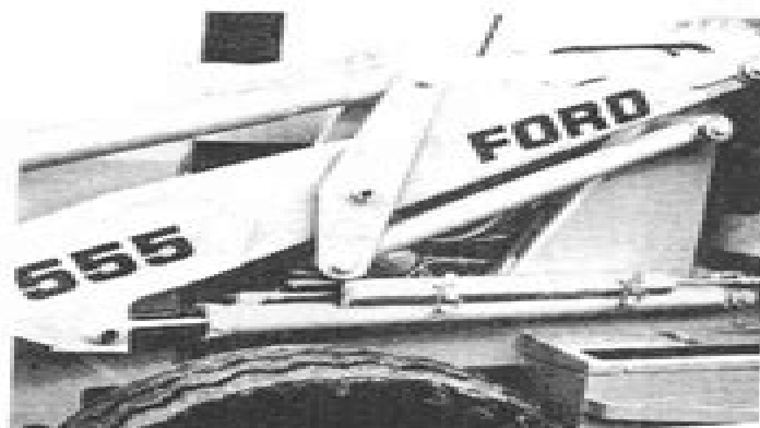
Figure 2 Loader Lift Cylinder "Safety Bar" Installed in Storage Position

WARNING: Service the engine compartment with the Loader bucket on the ground in the dumped position or in the raised position with the Loader lift cylinder "SAFETY BAR" installed (see Figure 1). Never work under or around a raised Loader without the "SAFETY BAR INSTALLED".