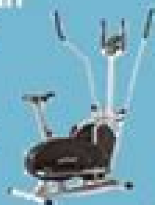
Powermax Fitness GH-200 12 inch

A short stride length can restrict movement and stop you exercising efficiently. Longer stride lengths are best for high intensity workouts.