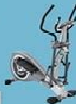
EC-1330 18- 22 inch