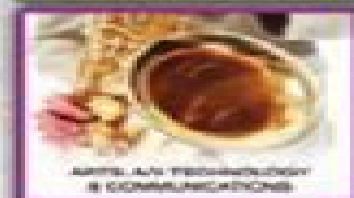
ARTS, A/V TECHNOLOGY & COMMUNICATIONS