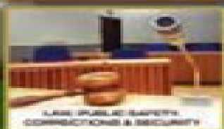
LAW, PUBLIC SAFETY, CORRECTIONS & SECURITY