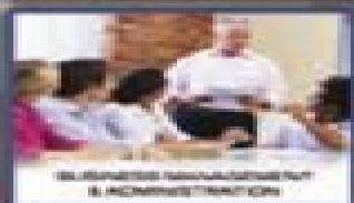
BUSINESS MANAGEMENT & ADMINISTRATION