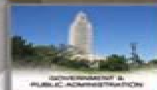
GOVERNMENT & PUBLIC ADMINISTRATION