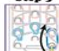
Grab the blue band on the right pin