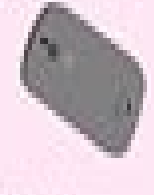
2. Insert the battery