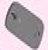
1. Remove the battery cover

Slide the battery cover off and insert the battery into the phone. The battery cover is shown in the phone package.