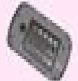
2. Insert the battery