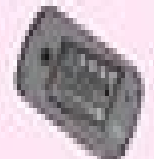
4. Insert the battery cover