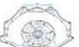
GM TH-225 General