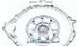
Ford C4, 302, 352, 360, 390, 400, 427, 429