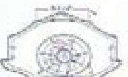
GM TH-400, 350, 250-48, 700R4, 3.80, 4.10, 4.62R Chevrolet