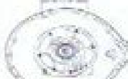
Chrysler TH-727, 341, 383, 400, 474, 440