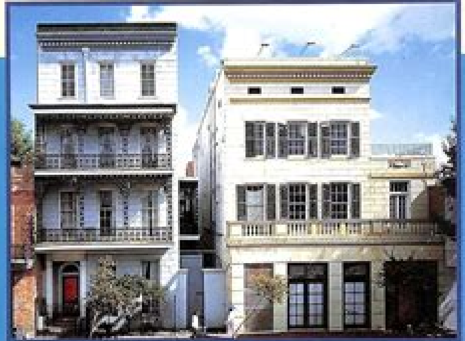
The same two buildings, 1991