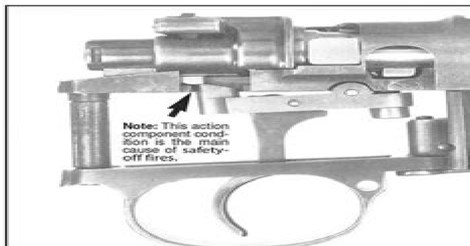
Figure 48- Shows the trigger sear in a cutaway M98 action blocked by cocking piece ledge overtravel that occurred when the trigger was cycled while the safety lever was in the safe position. This condition was caused by an altered top cocking piece safety lever engagement corner which reduced cocking piece/trigger clearance to less than zero. Note that this disconnects and blocks the trigger sear.