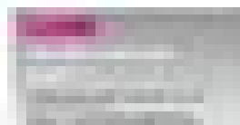
Quick Start Guide www.logikusa.com

If you need more information about our products, please visit our website at www.logikusa.com for more information.