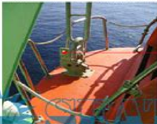
Boat strong point

Secure one end of the wire to the boat strong point, the other end of the wire to the davit strong point. Lower the boat till the boat is on the wires.