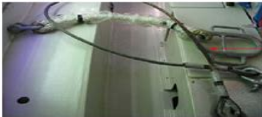
Emergency Recovery Wire

If circumstances do not permit the boat to be recovered by using boat falls. Use Emergency Recovery Wires. Connect wires to boat hooks forward and aft and use crane to recover rescue boat from water.