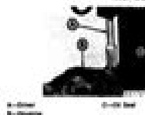
Fig. 12 Pressing in Oil Seal