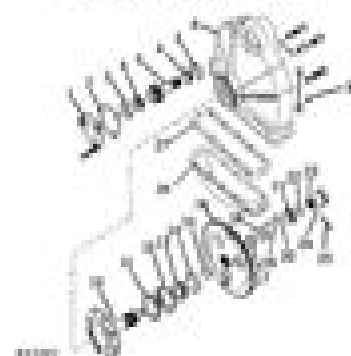
Fig. 2 Exploded View of Final Drive