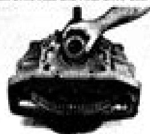
Fig. 16 Removing Gear Bearing

13. Remove the cap (24, Fig. 8), roller pin, oil seal nut, and washer from the end of the axle shaft, then remove the bearing cone (Fig. 17).