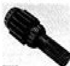
Fig. 3 Pinion and Bearing

Hot plastic: 0.001-0.002 inch (0.025-0.051 mm) Green plastic: 0.001-0.002 inch (0.025-0.051 mm) Steel: 0.001, 0.002, and 0.003 inch (0.025, 0.051, and 0.076 mm)