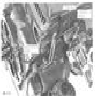
Fig. 11 Crankshaft and Governor Assembly

Inspect linkage between governor and flywheel to ensure proper adjustment. Figure 10.