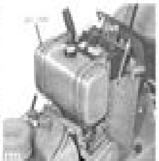
Fig. 17 Crankshaft and Governor Assembly

Attach governor lever to bracket shown in Figure 14. Governor lever is not an engine part. Refer to Section 10, Tractor Engine, for wiring diagram of governor.