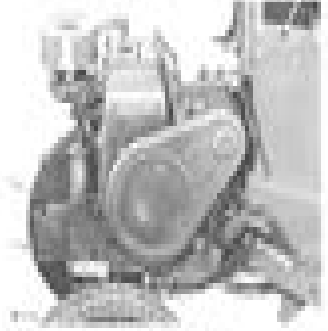
Fig. 13 Crankshaft and Governor Assembly

Position engine in tractor and attach engine feet to lower holes in tractor frame.