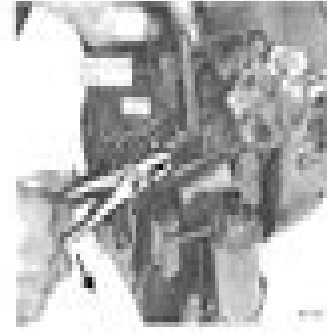
Fig. 12 Crankshaft and Governor Assembly

When block, supports and other governor parts, spring, and fuel governor are not all present, the fuel governor is positioned into slot in speed control disk.