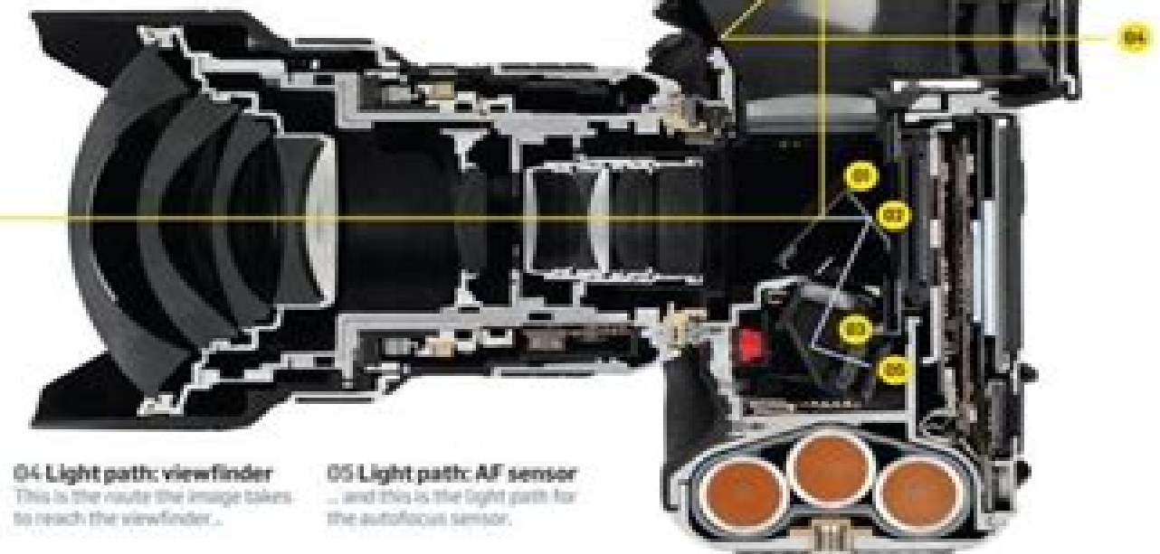
04 Light path: viewfinder This is the route the image takes to reach the viewfinder.

Different Nikon DSLRs use different autofocus sensors – the pro-level D4 uses Nikon's top-of-the-range SL-point Multi-CAM 3500FX sensor.