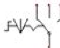
3 positions switch steady on left