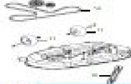
Deck B/N _____