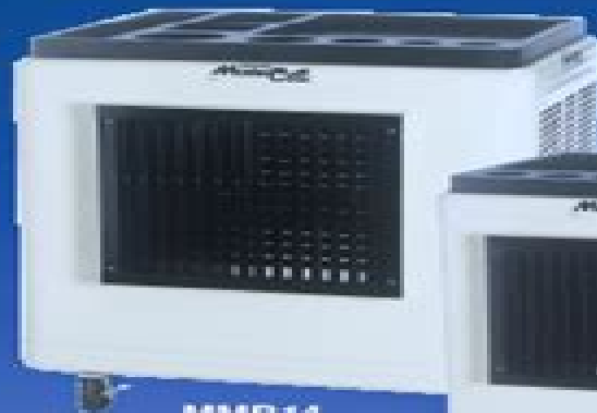
MMB14 4,500 cfm

The Quick, Easy And Affordable Solution To Spot Cooling — Indoors or Out!