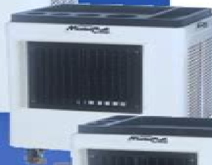
MMB12 3,000 cfm