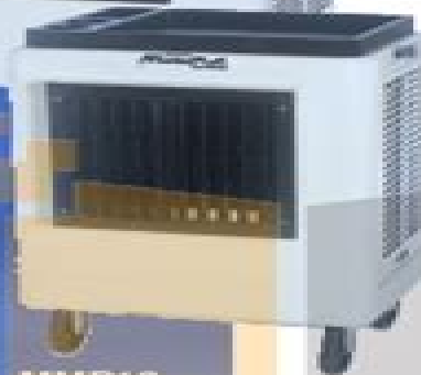
MMB10 2,000 cfm